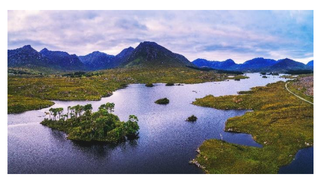
Sky Road Drive & Connemara and Clifden Day Tour

relax and enjoy a delicious dinner at the hotel.