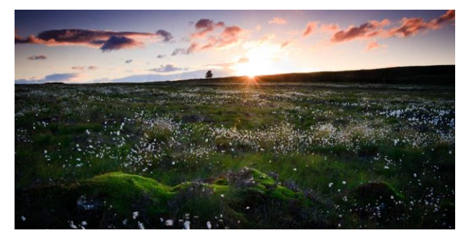
Day 7: Edinburgh & Pitlochry

This morning after breakfast we bid farewell to Inverness and travel to Edinburgh, the Capital of Scotland . Along the way we'll stop for lunch in Pitlochry, one of Scotland's most vibrant and charming places to visit. We'll then continue to Edinburgh, known for its beautiful scenery, rich clan history, and fine food! After checking-in to the hotel you'll have the rest of the evening to explore Edinburgh at your leisure and grab dinner